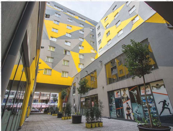
KOZLU HIGHER EDUCATION DORMITORY ZONGULDAK