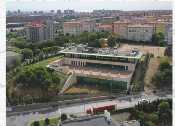
BAĞÇELİEVLER PUBLIC SPORT CENTER İSTANBUL