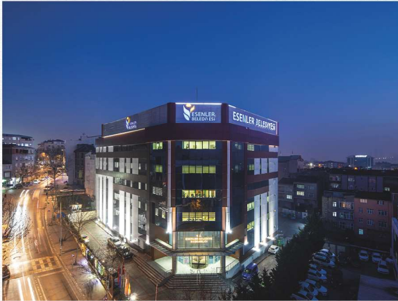
ESENLER CULTURAL CENTER İSTANBUL