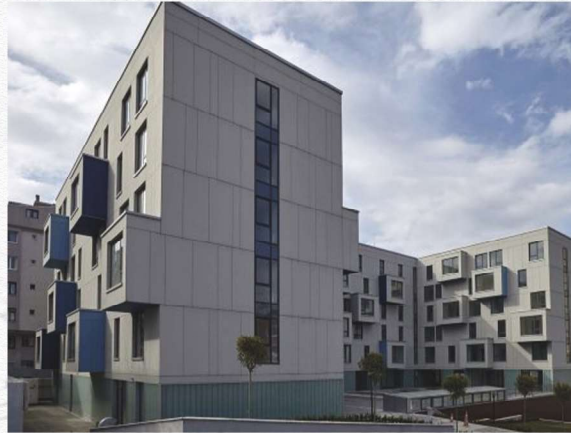
KADIKÖY HIGHER EDUCATION DORMITORY İSTANBUL