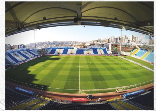
RECEP TAYYİP ERDOĞAN 14.235 PERSON STADIUM İSTANBUL