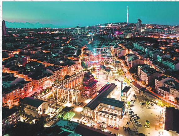
GAZHANE MUSEUM HASANPAŞA İSTANBUL